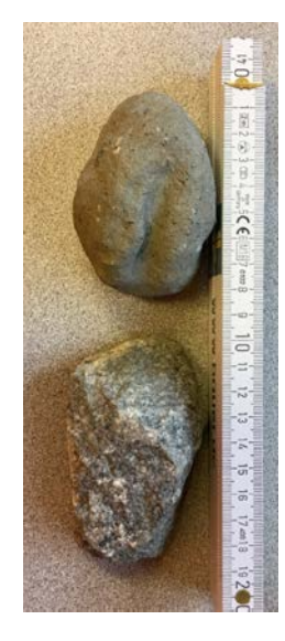
Trench Cutter fragments from the till (up to 80 millimetres)"